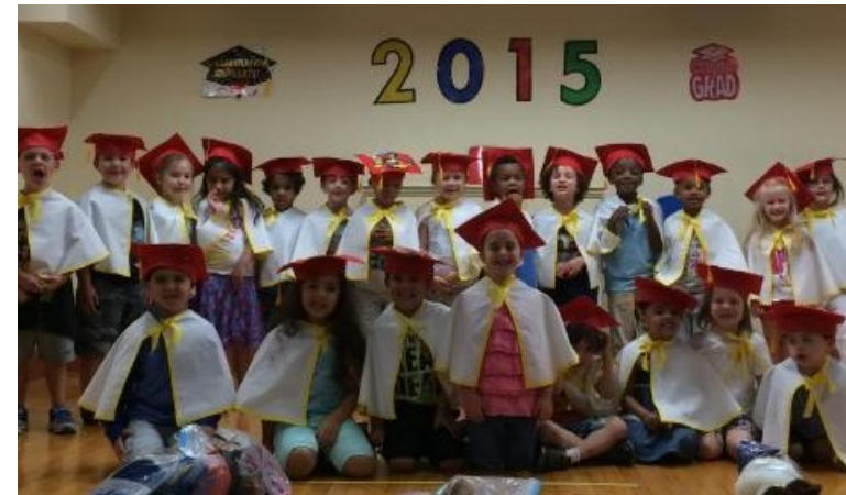
Children's Ark Preschool Class of 2015